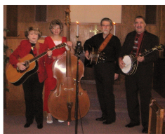
North Forty Bluegrass & Gospel Band